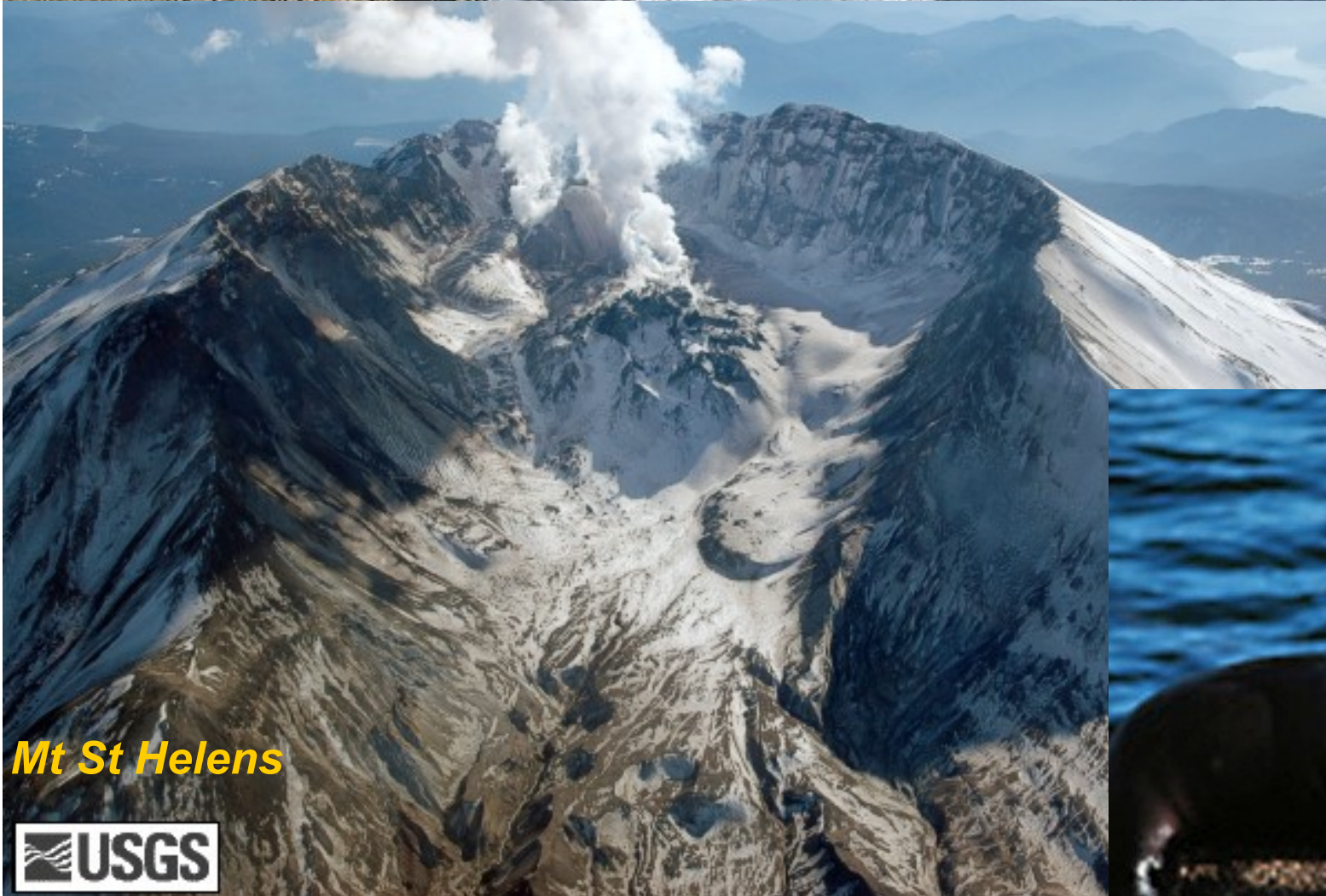
Mt St Helens